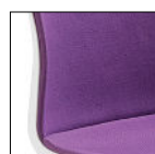
....SS Polipropilene monocoloro con parte anteriore sedile e schienale rivestiti One colour polypropylene shell with seat-back padded in the front