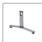
Piede vern. color alluminio Aluminium painted steel leg