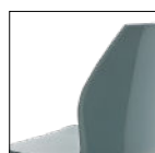
Polipropilene monocoloro One colour polypropylene