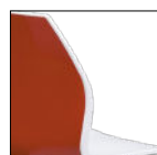
Polipropilene bicolore Retroschienale lucido Bicolor polypropylene Glossy backshell