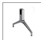
Piede alluminio lucido Polished alu. leg