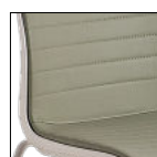
....SL Polipropilene monocoloro con parte anteriore sedile e schienale rivestiti con cuciture lineari One colour polypropylene shell with seat-back padded in the front with linear stitching