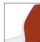
Polipropilene bicolore Two colours polypropylene