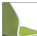
....S Monocoloro/bicolore con sedile imbottito One or two colours with padded seat