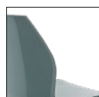
Polipropilene monocoloro Retroschienale lucido One colour polypropylene Glossy backshell